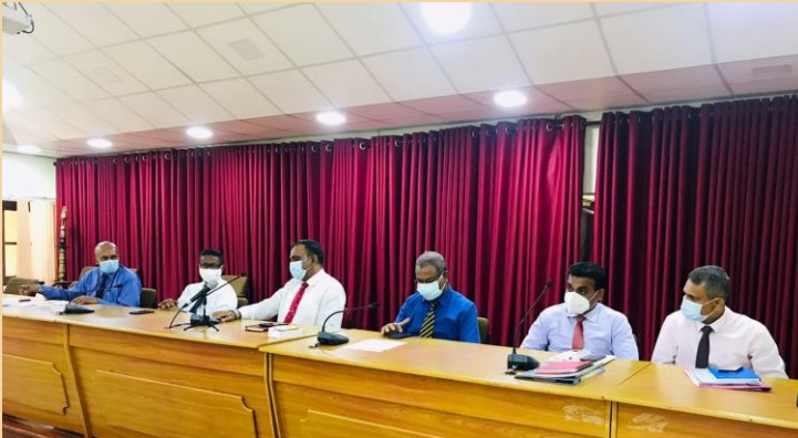
Branch reorganization Programme - Rathnapura