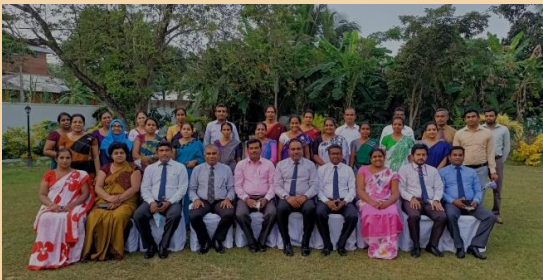
Branch reorganization programme- Galle